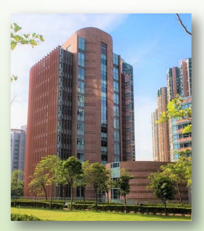
Cheng Yu Tung Tower